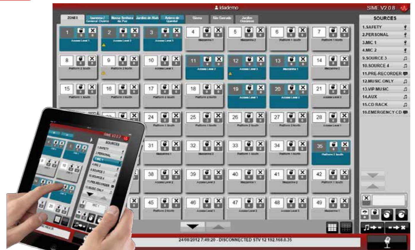
SIME Control (GUI)

Audio over Ethernet. Every NEO is capable of receiving up to 32 audio inputs from the data network (Cobranet) and route them to any zone in the system. In the above example, in Site 4 there are 4 analog audio inputs (3 music sources and a microphone) that the ZES 22 unit will convert to uncompressed high quality digital audio. These digital audio inputs can be routed from any NEO system to its zones or from SIME to any zone in the entire system.